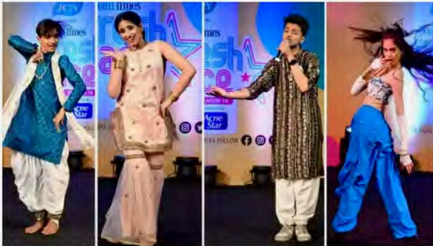
TFF contestants during the talent round

The contestants tackled questions like, 'What's the one product that the world can live without' to 'What's the one theme song to describe you' with spontaneity and wit.